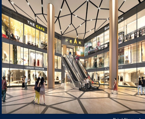
Third Storey A